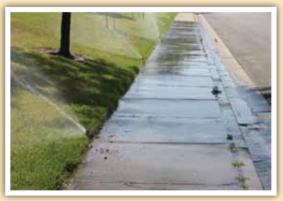
Be careful not to over-water your lawn. Avoid runoff.