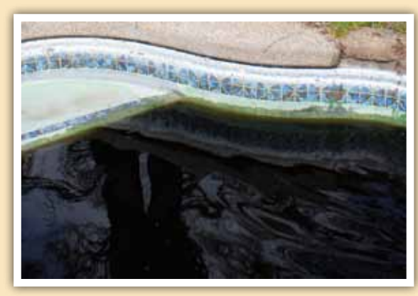
Maintain swimming pools and hot tubs.