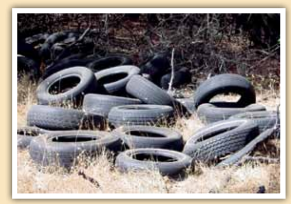
Old tires are mosquito breeding habitats. Dispose of them properly.