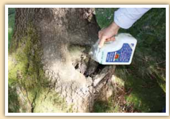
Fill treeholes with sand or an absorbent polymer like Agrosoke.

The District's website is a wealth of information. You can also make a service request, sign up for fogging notification and find out how to report a dead bird or squirrel.