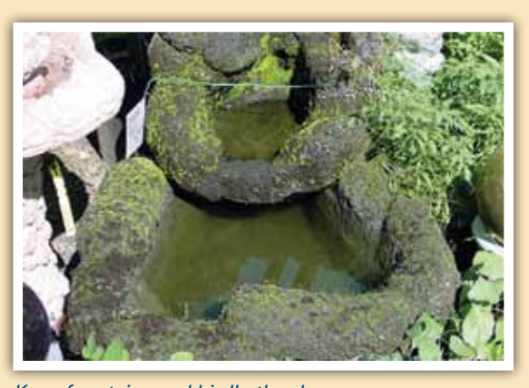
Keep fountains and birdbaths clean.