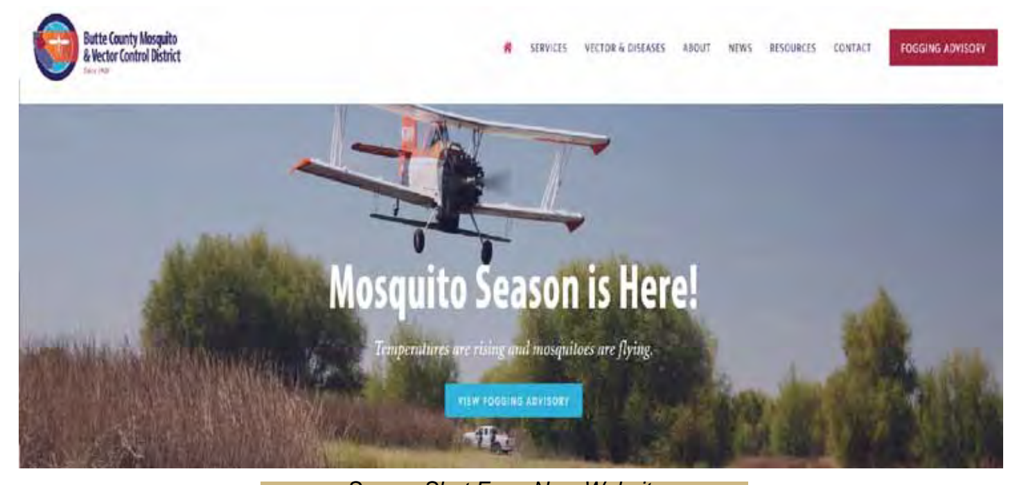
Screen Shot From New Website

After nearly 12 years, the District has a new website. The old website was getting dated, with concerns growing over security issues, lack of support, and noncompliance with new ADA and State regulations. The new website, built by Matson and Isom of Chico, is very user friendly, is accessible in phone, tablet, or PC mode, and is constantly monitored by Matson and Isom for security concerns, updates, licenses, and compliance issues.