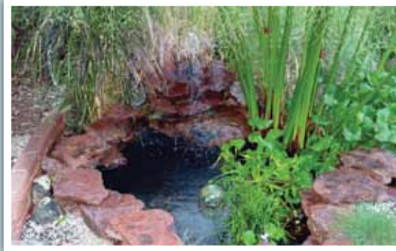
Ponds and Fountains