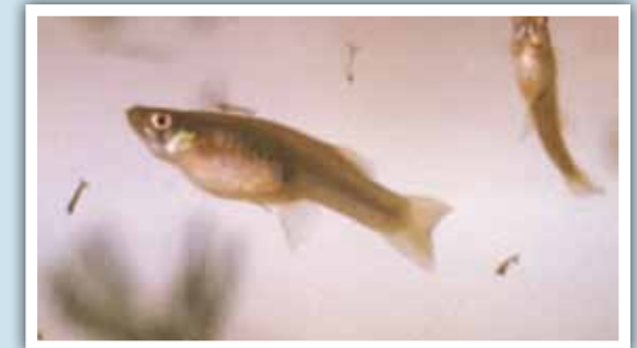
These tiny fish can daily eat their own weight in mosquito larvae, or pupae, and have been introduced throughout the world to aid in control of mosquitoes, especially where malaria and yellow fever are a threat.