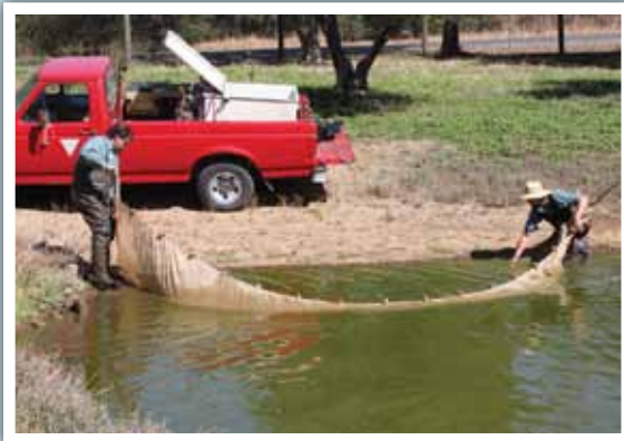
Mosquito and Vector Control Specialists seining mosquitofish from a seasonal pond that is drying. The mosquitofish will be replanted in other mosquito-breeding sources.

Wilbur's Feed 139 Meyers Street Chico, CA Phone: 895-0569