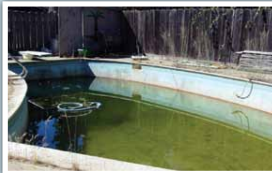
Unmaintained Swimming Pools